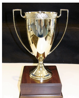
30 POINT CUP