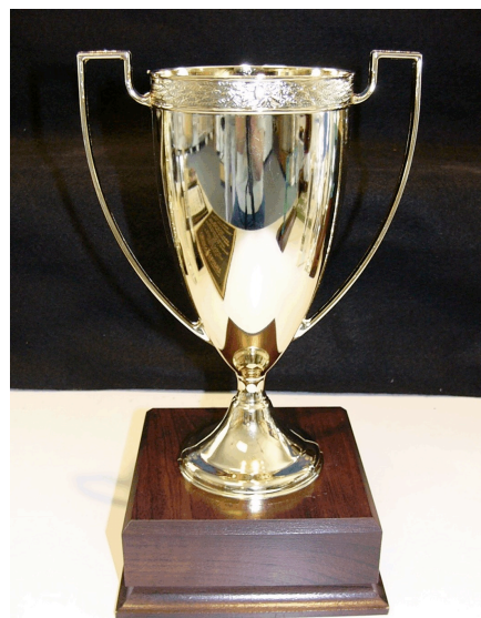
100 POINT CUP

Students of GCMTA teachers who participate in GCMTA performance events are able to accrue points toward these cups. A plaque is awarded to students reaching 200 points. Teachers contribute $5 for each student's award to allay the cost of these beautiful cups. Orders are placed by chair April 1 and June 1.